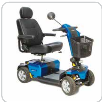
Shown in True Blue