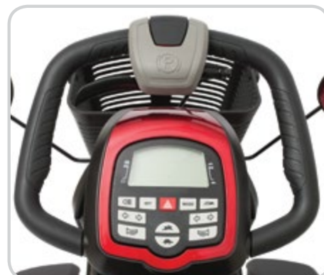
Full steering wheel with integrated digital display