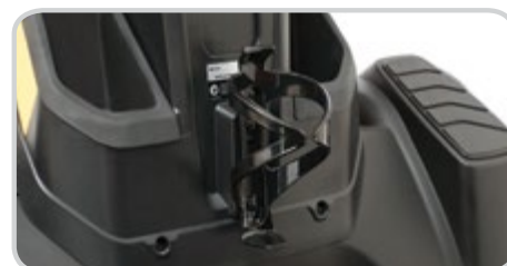
Water bottle holder standard